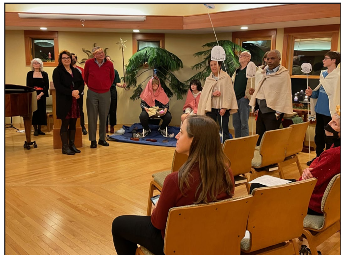
Many attendees participated in the pageant